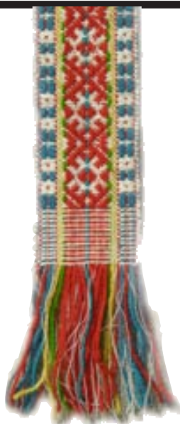
This beautiful sash could only mean one thing. Estonian Fair coming in December! Stay tuned for more details.

one of the great apes still needs to be put into a full-length documentary film. The other story in "Born to Be Wild 3D" is about a long-time inhabitant of East Africa who cares for baby elephants. Again, the charming pictures of keepers with their baby elephants following them is captivating and the bigger plight of elephants being poached for their ivory is yet another film in the making. The film is a heartwarming and moving depiction of two ladies who are extraordinary people who rescue and raise and defend endangered wild animals. "Arabia 3D Film" and the "1001 Inventions: Discover the Golden Age of Muslim Civilization Exhibit" takes audiences deep inside the heart of Saudi Arabia to travel with camel caravans across sand dunes, dive into the treasure-laden Red Sea and experience the Hajj pilgrimage to Mecca. The international traveling exhibit explores the scientific contributions of scholars from the diverse region stretching from Spain through China during the 7th to 17th centuries. While Europe was in the Middle Ages with little scientific research and discovery, the Arabian Peninsula and North Africa were flourishing with scientific exploration including not just male Muslim scholars but females and Jewish scientists, philosophers, academicians, and leaders.